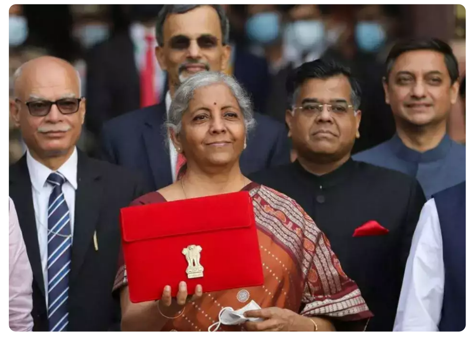
The Budget announcement reflects the intention of the government to introduce and strengthen digitization in India.